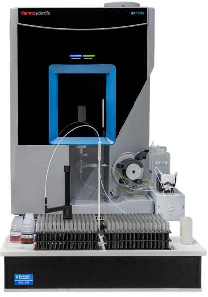
4DXCi SampleSense Oil Analysis System with iCAP PRO XPS

SampleSense Oil is a complete, automated sample introduction system for oil analysis. It combines the DXCi Autocorrecting Autosampler with SampleSense technology to fully automate the sample loading process. After the sample is mixed, the unique SampleSense valve automatically detects the presence of sample as it is loaded rapidly from the autosampler. Once the sample loop fill is confirmed by the sensors, the sample is automatically injected and the ICP-OES analysis is triggered for a tightly timed analytical sequence.