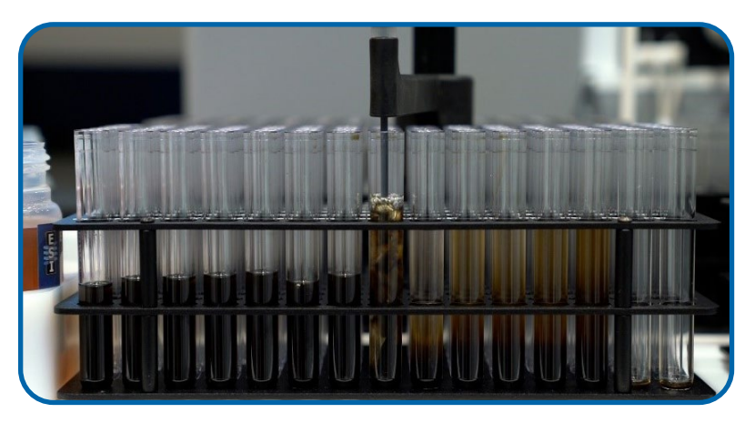
Controlled gas infusion mixing of used oil and solvent with SampleSense Oil system just prior to analysis on iCAP PRO XPS ICP-OES